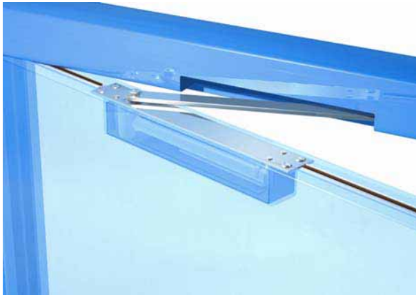
Pyrohinge® Intumescent gaskets used to insulate a concealed door closer mounted in a 54mm thick FD 60(S) door

For more information please contact Lindsey Hulin on 01252 333601 or lindsey@mannmcgowan.co.uk